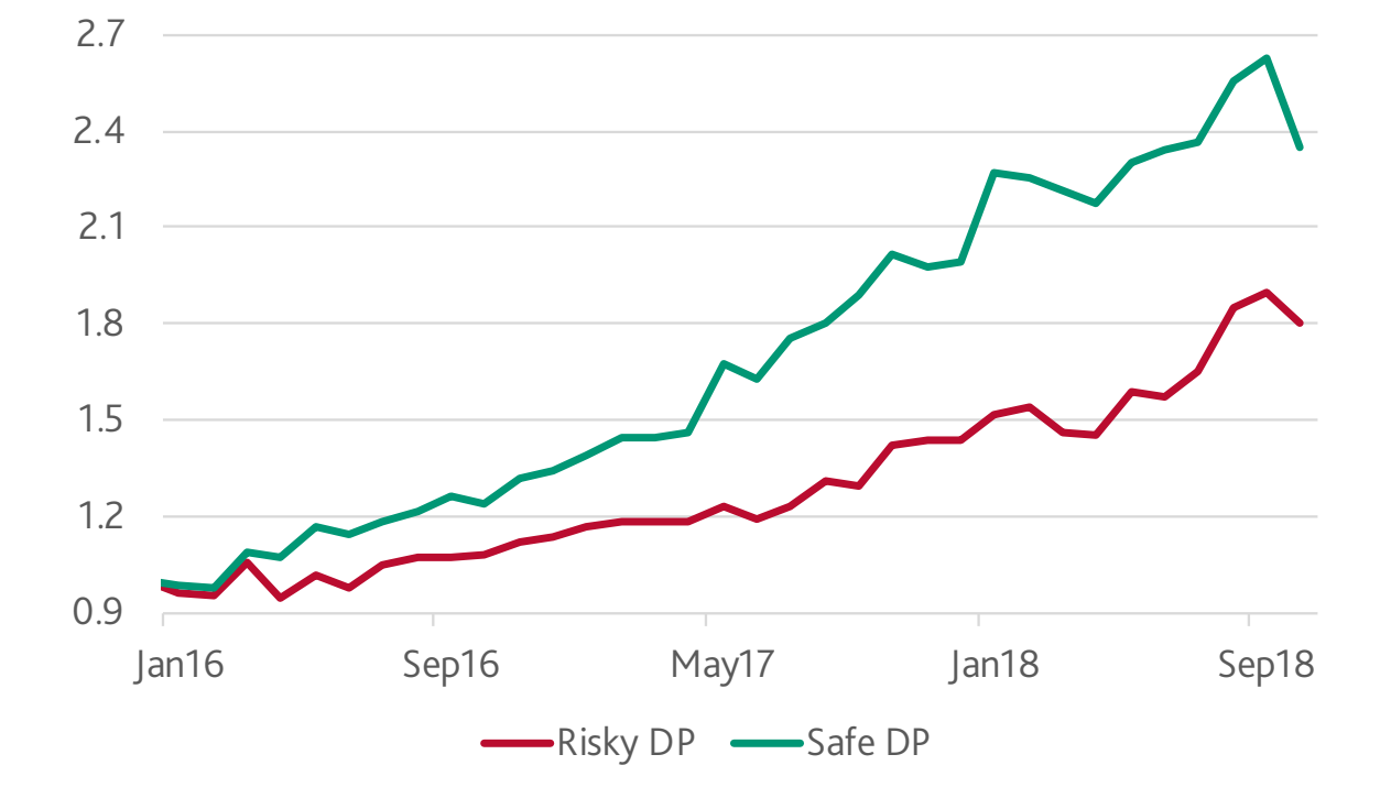
Figure 3. Cumulative returns of top and bottom quintiles formed on DP – Technology Sector (Jan. 2016- Oct. 2018)

In addition to the evidence in Figure 2 for the S&P 500 overall, we find that sorting by Deterioration Probability helps us to differentiate firms by cumulative returns for the technology sector specifically during the past two years. This can be seen in Figure 3, which displays cumulative returns over time for Safe and Risky DP factor style strategies for the US technology sector. Not all the technology firms performed alike, and the DP factor clearly helped to differentiate outperformers from underperformers during this recent period.