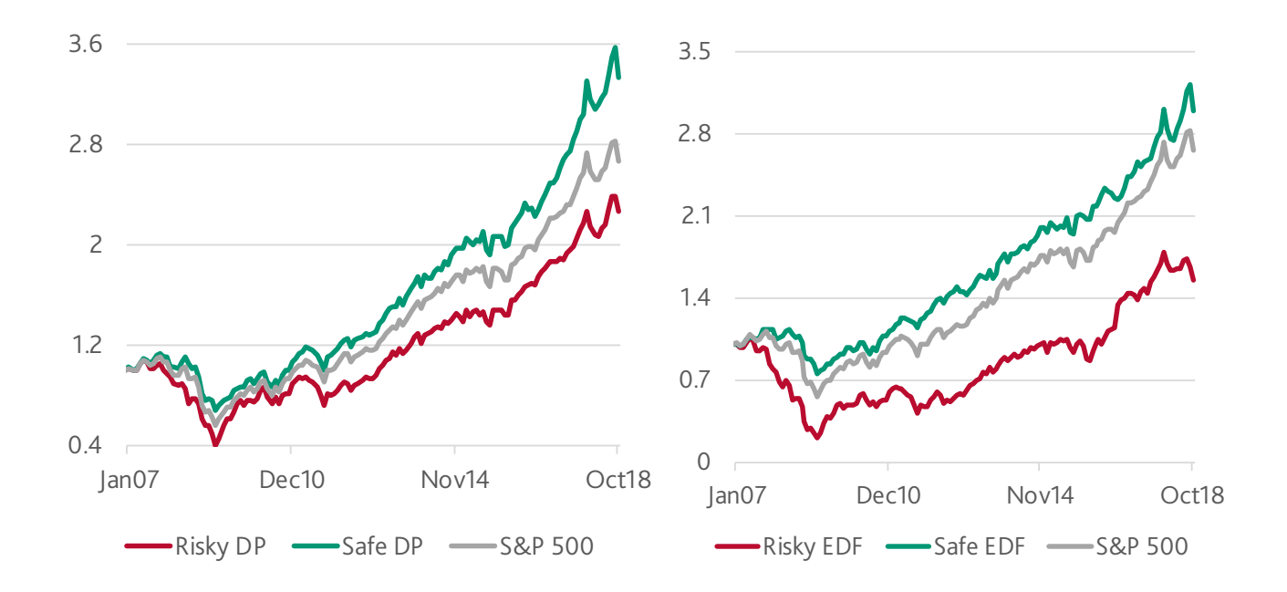
Figure 2b. EDF factor strategy