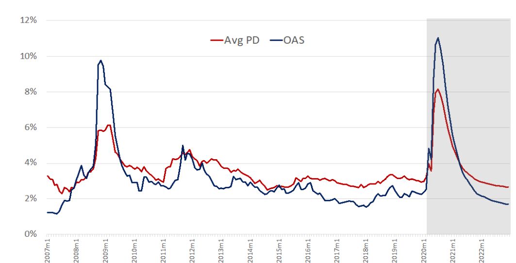
Figure 4: Projected Average Corporate PDs and Credit Spreads for Southeast Asia Under A Severely Adverse Economic Scenario

Linking back to our discussion above, although a credit crisis has not yet materialized that would drive up default risk to levels seen during the GFC, should economic conditions remain suppressed it is indeed possible that default risk could surpass those levels. Figure 4 shows the average corporate PD for the Southeast Asia region and the Option-Adjusted Spread (OAS) for the BofA-Merrill Lynch Asia Emerging Markets Corporate Plus Index back to 2007, as well as projections through 2022 for both series under the severely adverse economic scenario (the shaded area on the right side of the graph). In such a scenario, default risk and credit spreads for corporates in Southeast Asia would surpass the highs reached in 2008-9.