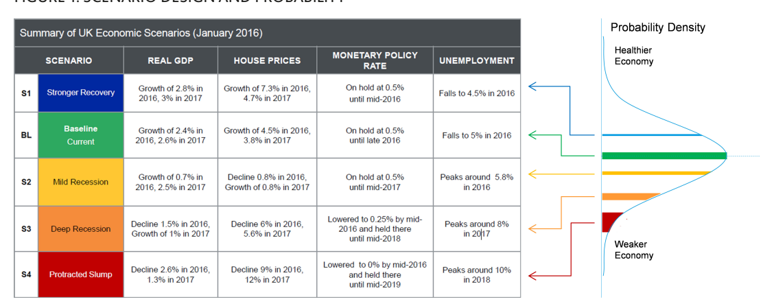
FIGURE 1. SCENARIO DESIGN AND PROBABILITY

The economic narrative typically identifies the trigger of the scenario taking place in any geography and articulates its impact onto the local economy, associated market forecasts and macroeconomic time series. All time series are then drilled down geographically to allow meaningful analysis of the impacts on the portfolio counterparties, associated expected credit losses, and provision levels.